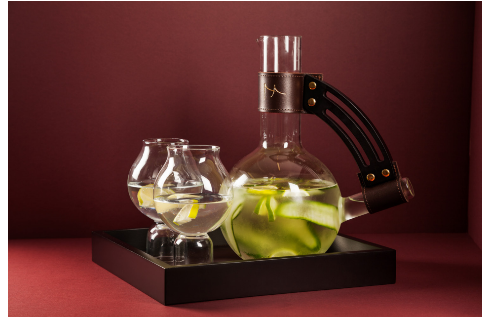
THE OKUTA CARAFE SET