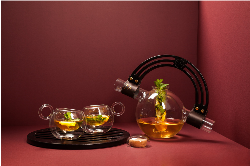
THE OKUTA TEA SET