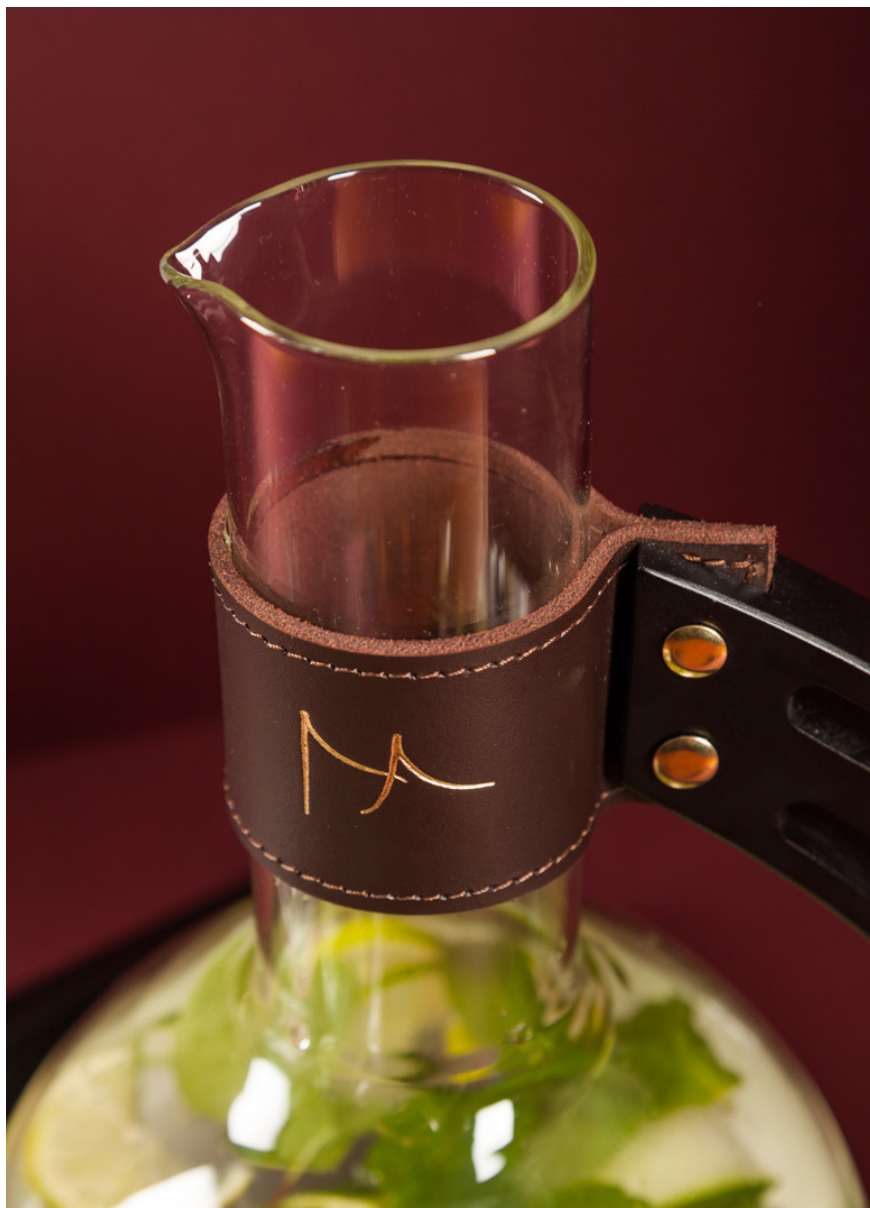
THE OKUTA CARAFE SET