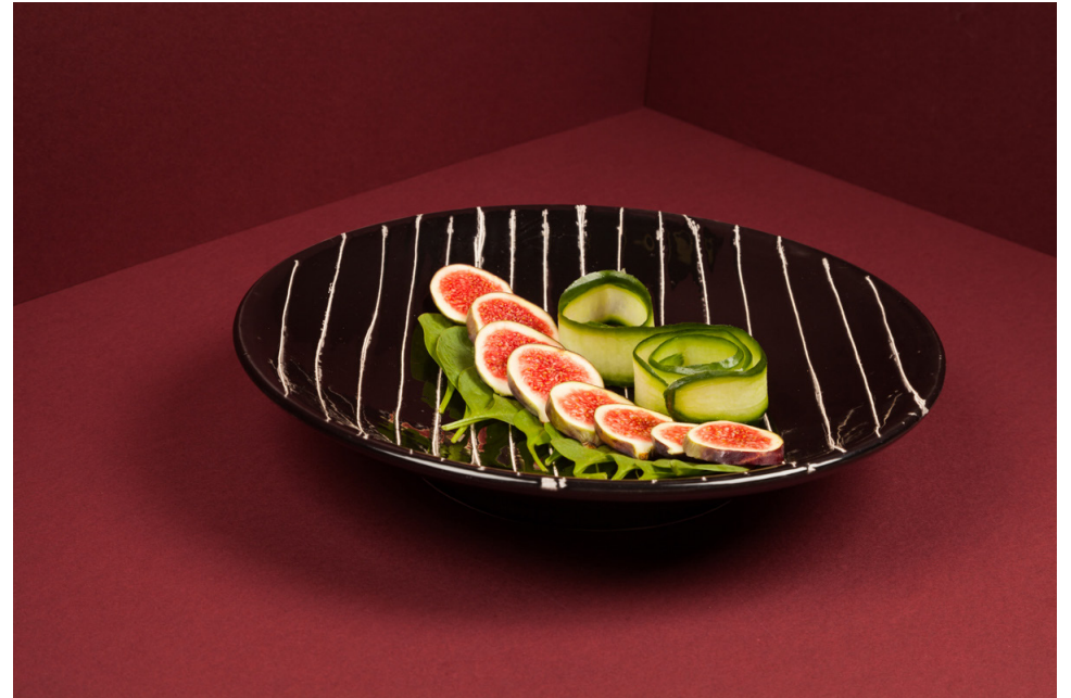
THE OKUTA CERAMIC PLATE