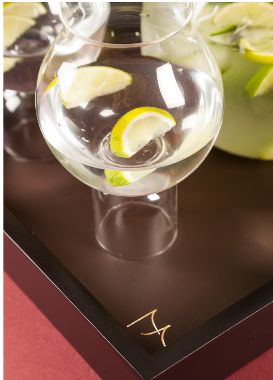
THE OKUTA CARAFE SET